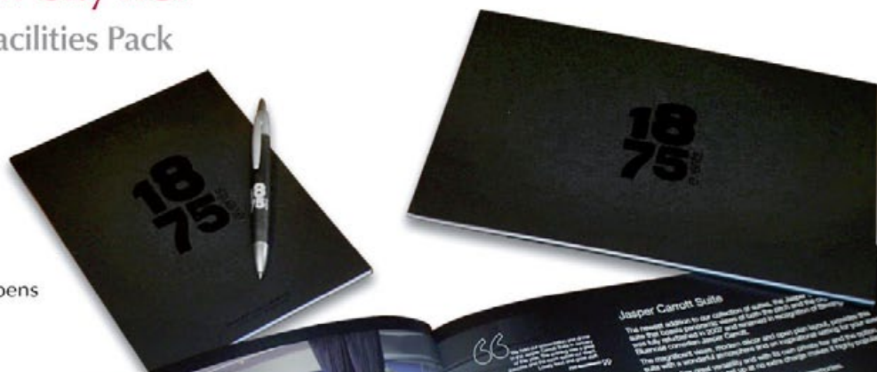
Note pad and pens